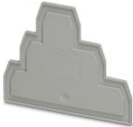
End cover, length: 90 mm, width: 2.2 mm, height: 69.8 mm, color: gray

Please be informed that the data shown in this PDF Document is generated from our Online Catalog. Please find the complete data in the user's documentation. Our General Terms of Use for Downloads are valid ( http://phoenixcontact.com/download )