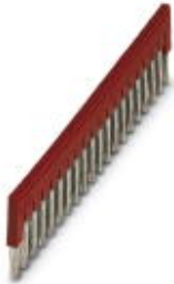
Plug-in bridge, pitch: 6.2 mm, width: 122.3 mm, number of positions: 20, color: red

Please be informed that the data shown in this PDF Document is generated from our Online Catalog. Please find the complete data in the user's documentation. Our General Terms of Use for Downloads are valid ( http://phoenixcontact.com/download )