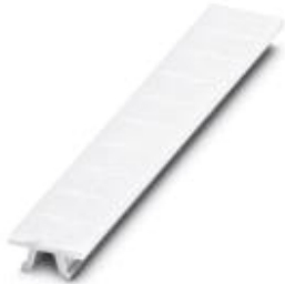
Zack marker strip, 10-section, vertically labeled with the consecutive numbers: 91 ... 100, white, width: 6 mm

Please be informed that the data shown in this PDF Document is generated from our Online Catalog. Please find the complete data in the user's documentation. Our General Terms of Use for Downloads are valid ( http://phoenixcontact.com/download )