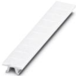
Zack marker strip, 10-section, vertically labeled with the consecutive numbers: 101 ... 110, white, width: 6 mm

Please be informed that the data shown in this PDF Document is generated from our Online Catalog. Please find the complete data in the user's documentation. Our General Terms of Use for Downloads are valid ( http://phoenixcontact.com/download )