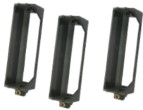
I/O Socket * 3