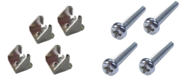
Panel clip * 4 and M4 x 30L Screw * 4