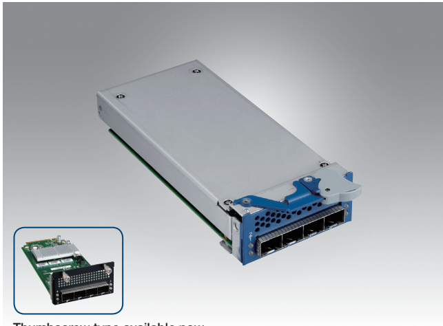
Thumbscrew type available now