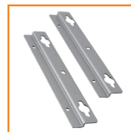
Wall Mount bracket