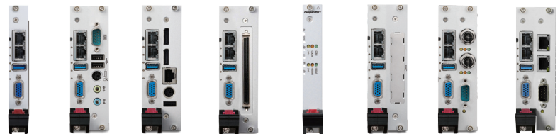
cPCI-3630 cPCI-3630D cPCI-3630G cPCI-3630M cPCI-3630N cPCI-3630S cPCI-3630T cPCI-3630TR