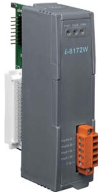
I-8172W 2-port FRnet module