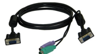
PS2 KVM Cable