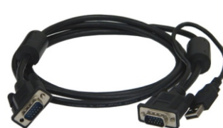
USB KVM Cable