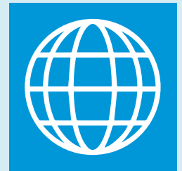
Global Brand - Trusted by the Trade