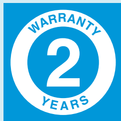
Two Year Warranty *Excludes Ice Machines