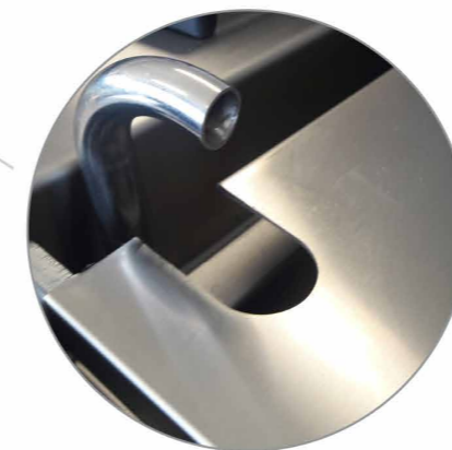
Automatic water-filling with a fixed tap located on the top.