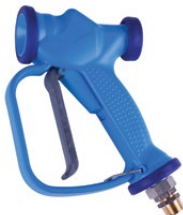
T-TWSGV65SVL (Trigger Gun)