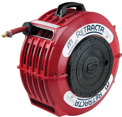
T-TWHWR1215 (Hot Wash Reel and Hose)