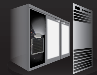
Quicker, safer servicing