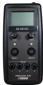
Handheld Remote Control

The wireless handheld remote control includes programmable scenarios for ease of operations. It provides full system operation from up to 200 yards away and includes real-time telemetry for sensor feedback and vitals data.