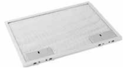
REPLACEMENT FILTER TO SUIT CAMEC 12V RANGEHOOD (REFER CODE 040864)