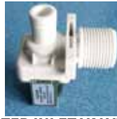
WATER INLET VALVE - PART ID 16 - 041912