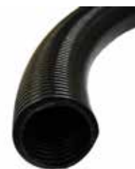
CAMEC RANGEHOOD DUCT TUBE BLACK