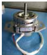
MOTOR - PART ID 68 041909