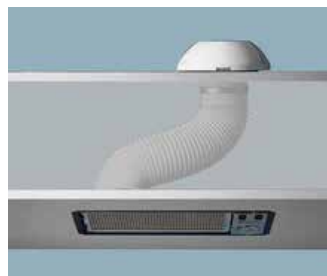
ELECTROLUX FLUSH MOUNT RANGEHOOD 12V CK150

Note: This switch will illuminate for the 12V rangehoods.