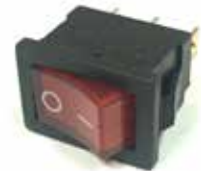
SWITCH FOR CAMEC RANGEHOOD