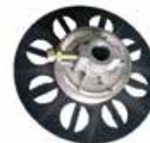
MOTOR PULLEY - PART ID 66 - 041919