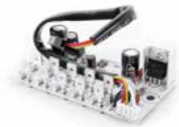
REPLACEMENT CIRCUIT BOARD TO SUIT CAMEC 12V RANGEHOOD (REFER CODE 040865 & 040864)