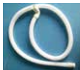
DRAIN HOSE - PART ID 89 042798