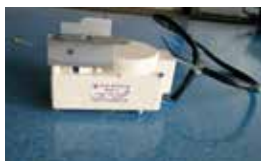
MODE SWITCH - PART ID 55 T - 041911