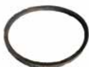
V-BELT - PART ID 65 041914