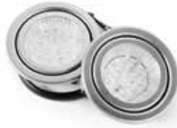
REPLACEMENT LED DOWN LIGHT SHORT LEAD (PCB SIDE) TO SUIT CAMEC 12V RANGEHOOD (REFER CODE 040864)