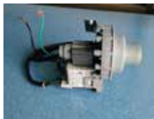
DRAIN PUMP - PART ID 91 - 041913