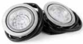
REPLACEMENT LED DOWN LIGHT LONG LEAD TO SUIT CAMEC 12V RANGEHOOD (REFER CODE 040864)