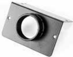
OUTLET ADAPTOR TO SUIT CAMEC 12V RANGEHOOD - REFER CODE 040864