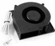
REPLACEMENT FAN TO SUIT CAMEC 12V RANGEHOOD (REFER CODE 040864)