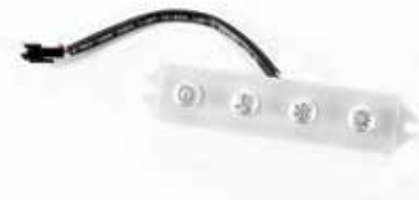
REPLACEMENT SWITCH PANEL TO SUIT CAMEC 12V RANGEHOOD (REFER CODE 040864)