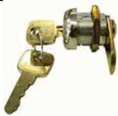
CAMLOCK 008242 - LONG THREAD 32MM 035550 - SHORT THREAD 28MM FEATURES: • Threaded cylinder lock commonly used on access doors