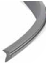
MILLARD/ALFAB POW GLAZE-WEDGE 008552