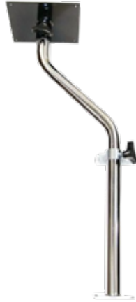
SWING AWAY TABLE LEG 4 PIECE 007892

Replacement wing nut for wineglass table leg