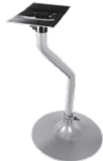
WINEGLASS LEG BENT TUBE 035213