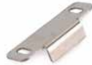
MINI CUPBOARD CATCH STRIKER 008095