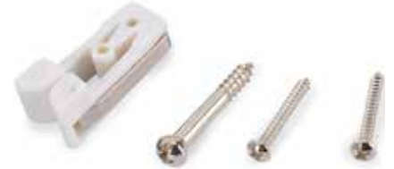
SCREW GRIPPER CATCH 008060