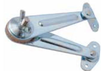
WINDOW STAY 802 008014 SMALL 008013 LARGE

This folding stay is available in two sizes and was often used as a window stay in older caravans.