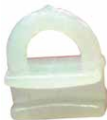
METRO CURTAIN RUNNER 035440

To suit aluminium track (refer code 036495).