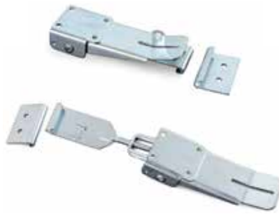
CAMPER ROOF CLAMP LOCKABLE 008267

This clamp is commonly used on pop top caravans and wind up campers to hold down the roof while the trailer is in storage or while travelling.