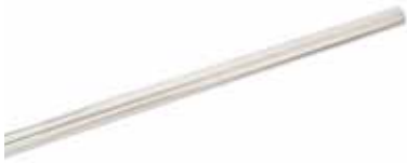
TOWEL RAIL 3.6M 039112 - TAINLESS STEEL 16MM 039113 - STAINLESS STEEL 19MM 008203 - CHROME PLATED 19MM SPECIFICATIONS: • Length: 3.6m