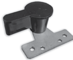
MILLARD POW PLASTIC/METAL LOCK 008553 • Push out window swivel lock • Plastic lever with metal base • Black