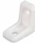
COMERANGLE BARS - WHITE 008158