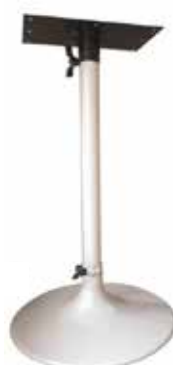
WINEGLASS TABLE LEG 044956

This Wineglass Table Leg complete with base and top comes in four parts (top plate, tube, bottom plate & anchor), making it easier to pack up and store while on the go in your caravan or camping.