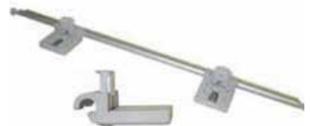
TABLE SLIDE RAIL KIT

Replacement plastic hinge for table support legs (refer codes 007873, 007874 and 007875). Suitable for folding the table leg.