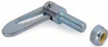
UTILITY FASTENERS BOLT ON 035320