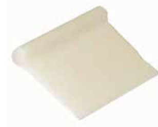
CURTAIN TAB (JAYCO) 007807