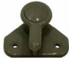
VISCOUNT POW GREY KNOB LOCK 008556 Nylon push out window lock. • Grey