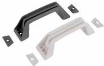
GRAB HANDLE VECAM 007980 GREY 007983 WHITE

A strong plastic grab handle suitable as a pull handle on the corner of caravans or camper trailers. Gasket not included. Please use silicone under the handle and also on the threads of your screws.