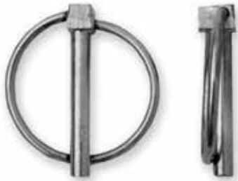
UTILITY LYNCH PIN TRACTOR CLIP B3 8MM 035385