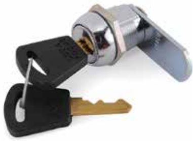
CAMLOCK 008240 - SHORT THREAD KEY/ALIKE 16MM 008243 - LONG THREAD RANDOM KEYED