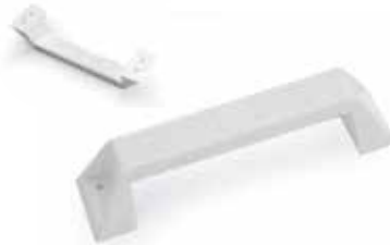
GRAB HANDLE PLASTIC 007988

A strong plastic grab handle suitable as a pull handle on the corner of caravans or camper trailers. Gasket not included. Please use silicone under the handle and also on the threads of your screws.