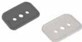
GRAB HANDLE GASKET VECAM 007981 GREY 007984 WHITE

Replacement gasket for grab handle (refer code 007980).