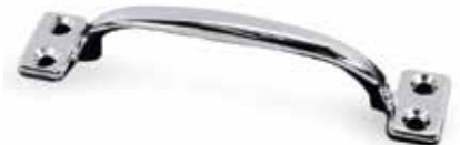
EMRO HANDLE 036752

A strong chrome plated handle suitable as a pull handle on the corner of caravan.