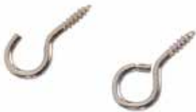
SCREW EYE AND SCREW HOOK 007802 SCREW EYE 007803 SCREW HOOK • SUIT 007775 WIRE