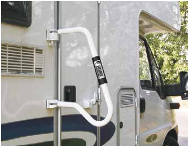
FIAMMA SECURITY 46 PRO HANDLE 034093 Security handles take up little space when folded against wall. They serve as a useful handle to make entering and exiting the vehicle easier. They adapt to all doors, opening both to the right and left. Includes installation brackets, screws and internal counter brackets.