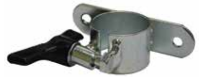
SWING AWAY COLLAR FOR TABLE LEG 007897

Replacement swing away collar for table leg (refer code 007892).