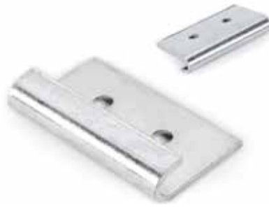
J CLIP - ROOF CLAMP 008270

Replacement J Clip for both standard and locking silver clamps.