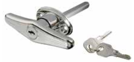
GARAGE DOOR LOCK METAL FRONT FIXING 008246 • Dimensions: 140mm(l) x 30mm(h) x 110mm(d)