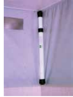
POP TOP INTERIOR SUPPORT 035303

Internal support for pop top camper roof.