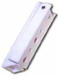
BAGGAGE PLASTIC DOOR CATCH 008067

Keeps baggage compartment open. Catch mounts on vehicle and allows easy, trouble free access.