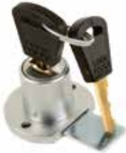
CAMLOCK - LONG TONGUE 008231 - 22MM BOLT LOCK 008239 - CAMLOCK WITH KEY #60009