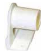
SNAP IN MUSLIN BRACKET 007786

Use screws or double sided tape to attach to wall or ceiling.