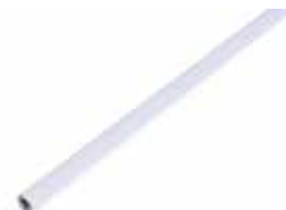
EXPANDING PLASTIC COATED WIRE 007775