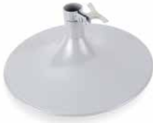
SPLIT BASE - WINEGLASS TABLE LEG LESS WING NUT 007936

Replacement base for wineglass table leg. Wing nut not included.