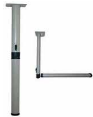
BI-FOLD TABLE LEG 007905

This unique table top hinge set offers versatility and portability. The table top can be lifted from the wall bracket and conveniently positioned elsewhere on the caravan, even outdoors.