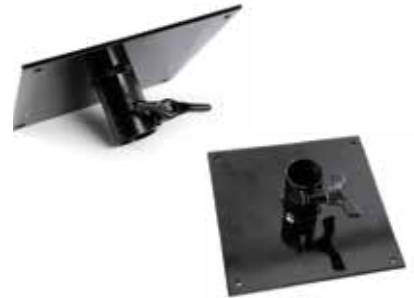
TOP PLATE SWING AWAY TABLE LEG 007895

Replacement swing away collar for table leg (refer code 007892).