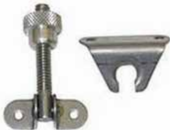
SWINGING BOLT AND PLATE 38MM (2PC) 007997 Used on old style protector shades