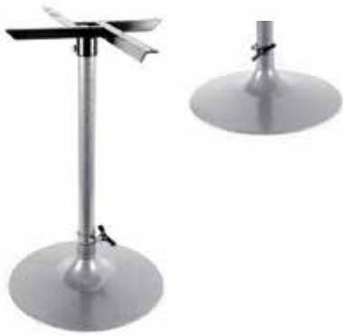
WINEGLASS TABLE LEG WITH ANGLE IRON TOP 007884

A wineglass shaped leg with an angle iron split top.