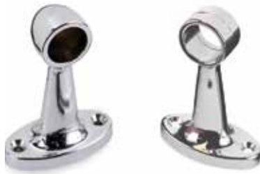
PILLAR END AND CENTRE 008201 - PILLAR END 5/8" - 16MM RAIL CHROME 008197 - PILLAR END 3/4" - 19MM RAIL CHROME 008223 - PILLAR END NICKEL 008196 - PILLAR CENTRE 3/4 19MM RAIL CHROME To suit towel rails rails.