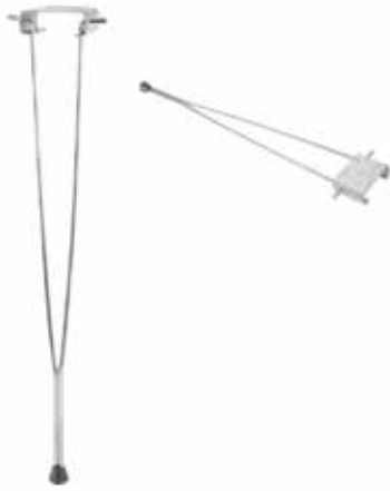
TABLE LEG - V TYPE 007904

These simple "V" shaped, chromed wire legs which lock for vertical support, can pivot horizontally under the table top for ease of storage or when the table top is being used as a bed.