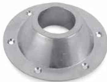
TABLE LEG TOP FLUSH 035547

Replacement top flush plate base to suit tube 55mm in diameter.