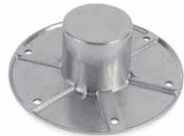
TABLE LEG BASE RECESSED 035548

Replacement top flush plate base to suit tube 55mm in diameter.