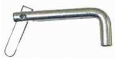
DROP NOSE PIN 008289

This simple locking device has many applications such as securing the raiser arm roof clamp.