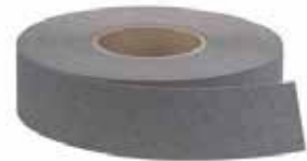
NON SKID GRIP TAPE 000167