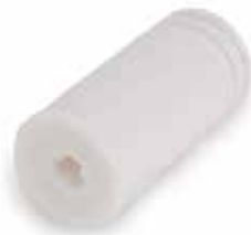
ROUND DOOR STOP AND SCREW 75MM 008228 • White