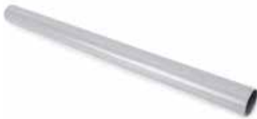
WINEGLASS TABLE LEG TUBE ONLY 007934

Replacement tube for wineglass table leg