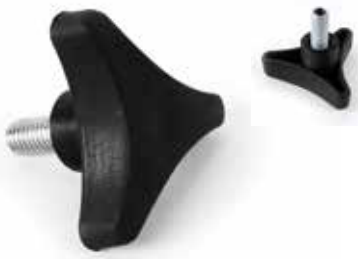
LOCKING KNOB - EASY LIFT LEG 007940

Replacement locking knob with a 3/8" Whitworth thread to suit Eazy lift table leg (refer code 007890).