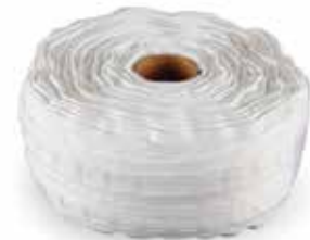
GATHERING TAPE NATURAL 007810 PER METRE