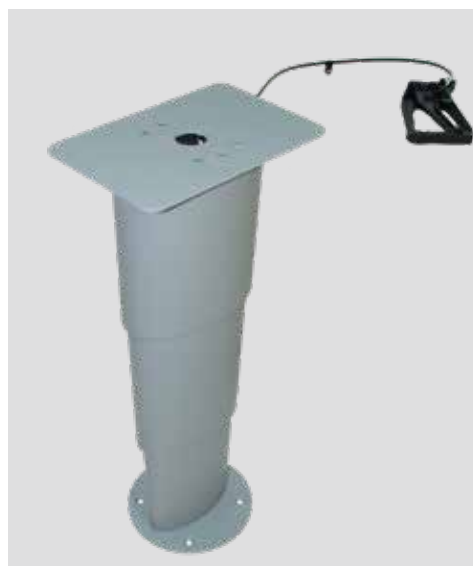
PRIMERO COMFORT TABLE SUPPORT 044429

Replacement recessed base to suit tube 55mm in diameter.