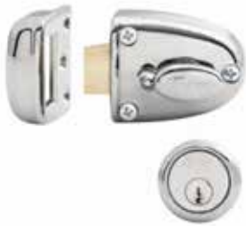
LOCKWOOD 200 STREAMLATCH 008235

Main door lock ideal for narrow door stiles.