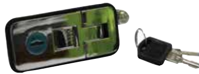
COMPRESS LATCH SMALL FLUSH FITTING 008238