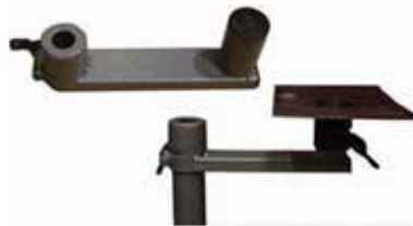
WINEGLASS TABLE SWIVEL ADAPTOR 038519 - SHORT 205 X 80 X 100 038520 - LONG 260 X 80 X 100

Replacement bracket in two sizes, fits most existing table tubes that are around 45mm in diameter.