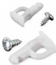
END STOP PUSH IN 007798 To suit metro track.