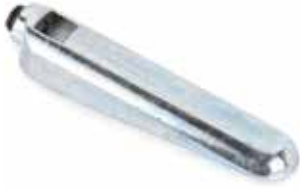
GARAGE LOCK CAST TONGUE 008248