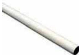
POWDER COATED ROD 007771