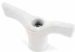
WING NUT - WINEGLASS TABLE LEG 007937

Replacement base for wineglass table leg. Wing nut not included.