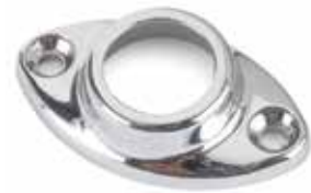
FLANGE RAIL OVAL SHAPE 008198 3/4" - 19MM To suit towel rails. Chrome plated steel.