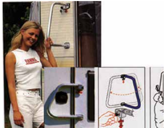
FIAMMA SECURITY DOOR HANDLE 000746 310MM 000747 460MM Fiamma Helping Hand Door Handle is made of solid aluminium. It serves as a convenient handle to make entering and exiting the vehicle easier. When closed back onto the door, it works as an anti-theft device.