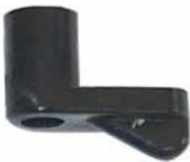
FLY SCREEN TURN BUTTON 5/16 008258 A simple locking device for hinged fly screens. • Black