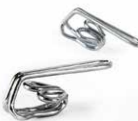
STEEL CURTAIN GATHERING HOOK NO 7 007799