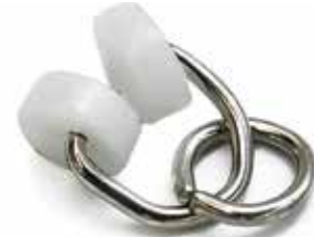
CURTAIN RUNNER (JAYCO) 007808