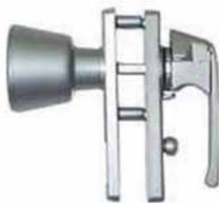
SCREEN DOOR LOCK 008244 Used on camper trailer doors and shower doors. • Silver