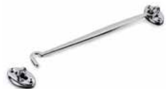
CABIN HOOK 008182 75MM WITH EYE 008183 100MM WITH EYE 008185 150MM WITH EYE 008186 200MM WITH EYE 008187 CABIN HOOK EYE ONLY