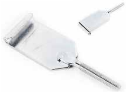
TONGUE - STANDARD ROOF CLAMP 008269

Replacement zinc plated tongue for the standard and locking silver clamp.