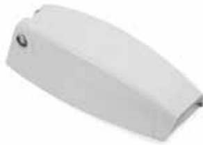
HOLDING CATCH ACCESS DOOR 008161