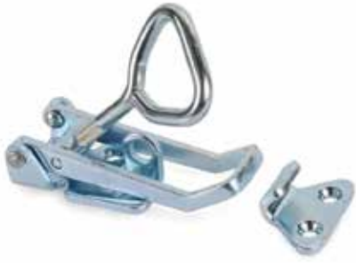
TOGGLE CLAMP WITH PLATE 008276

Special locking catch mechanism prohibits the latch opening accidentally.