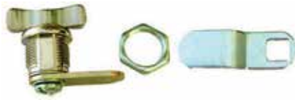
CYLINDER LOCK - NO KEY 008252 • Chrome plated thumb operated camlock for baggage doors • Not lockable • 5/8" wing nut