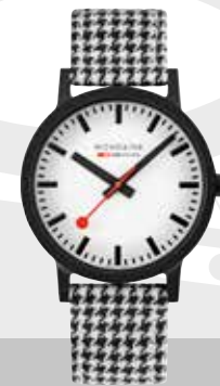
MS1.41110.LN Ø 41 mm