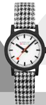
MS1.32110.LN Ø 32 mm