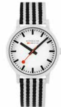
MS1.41110.LA Ø 41 mm