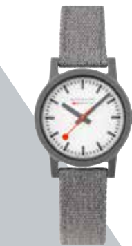
MS1.32110.LU Ø 32 mm