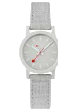
MS1.32170.LK Ø 32 mm