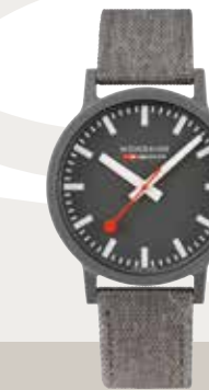
MS1.41180.LLH Ø 41 mm