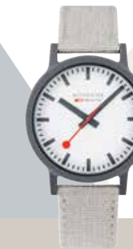
MS1.41111.LH Ø 41 mm