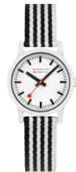
MS1.32110.LA Ø 32 mm