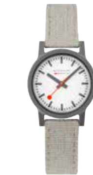
MS1.32111.LH Ø 32 mm