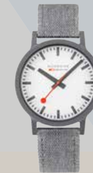
MS1.41110.LU Ø 41 mm