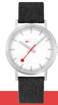
A660.30360.17SBB Ø 40 mm