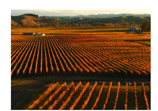
Size: 17ha Sub-region: Bridge Pa Triangle Soils: Inland alluvial & red metal Plantings: Chardonnay, Syrah, Merlot, Malbec, Tempranillo

Our EARTH vineyard is found furthest inland on some of the oldest and deepest soils in Hawke's Bay. It is a warmer site on richer, layered sub-soils that produces broad and rounded, well flavoured, fruit dense, fleshy wines.