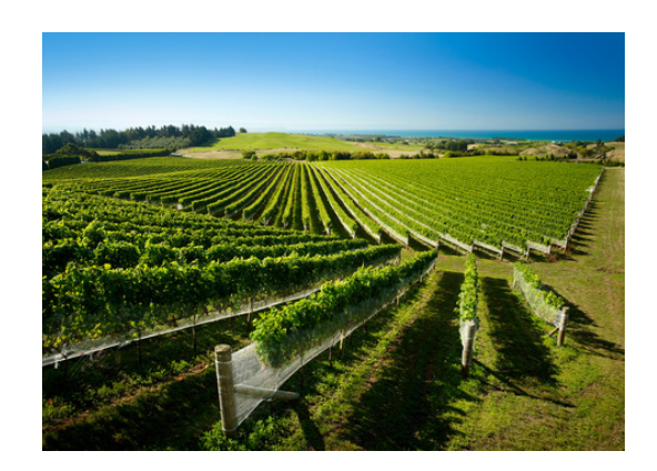
Size: 25ha Sub-region: Te Awanga Soils: Coastal shingle & clay Plantings: Chardonnay, Sauvignon Blanc, Pinot Gris, Viognier, Syrah

Our SEA vineyard is located right on the Pacific coast at Te Awanga. Influenced by its coastal positioning, cool ocean breezes and shingle soils. The wines show great fresh liveliness, a salivating saline acidity and lifted fragrant aromatics.