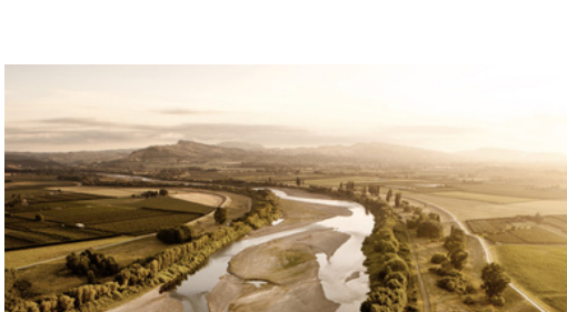
Size: 18ha Sub-region: Gimblett Gravels Soils: Inland deep gravel & silt Plantings: Syrah, Merlot, Malbec, Cab Sauv, Cab Franc, Chardonnay

Our STONE vineyard is composed of gravel and silt layers originally formed after a great flood of the Ngaruroro river in 1867. The river stones absorbs and radiate heat on the vines to create concentrated, structured, bold, ageworthy wines.