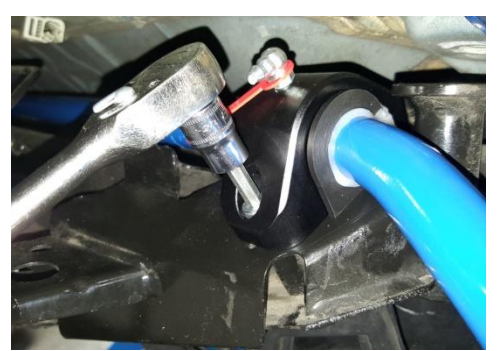
Install NM Billet Bushing Clamps (grease fitting facing rearward) and supplied bolts. Torque to 34 Nm (25 ft-lbs).