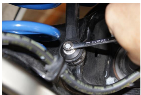
Attach upper end-links to NM anti-roll bar using original nuts. Torque to 48Nm (35 ftlbs). Then tighten lower end-link bolt. Torque to 34Nm (25 ft.-lbs.). See adjustment chart for hole position information. NOTE: NM Eng. Rear Sway Bar Link Kit recommended.