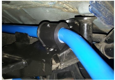
Apply supplied grease to inside of supplied urethane bushings and install on NM anti-roll