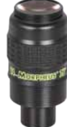
Morpheus® Eyepiece with M43-thread