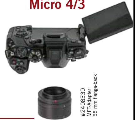
#2408330 MFT-Adapter 55 mm flange-back