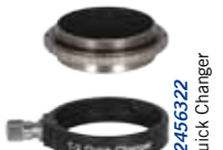
#2456322 Quick Changer