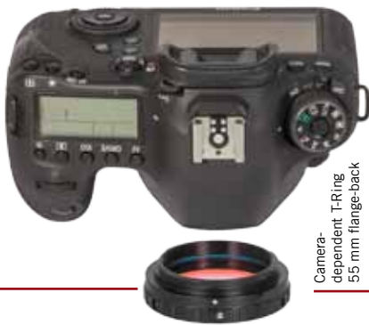
Camera-dependent T-Ring 55 mm flange-back