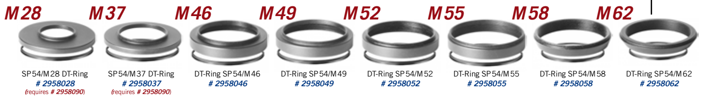
M28 SP54/M28 DT-Ring # 2958028 (requires # 2958090) M37 SP54/M37 DT-Ring # 2958037 (requires # 2958090) M46 DT-Ring SP54/M46 # 2958046 M49 DT-Ring SP54/M49 # 2958049 M52 DT-Ring SP54/M52 # 2958052 M55 DT-Ring SP54/M55 # 2958055 M58 DT-Ring SP54/M58 # 2958058 M62 DT-Ring SP54/M62 # 2958062