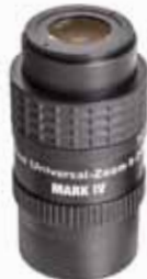
Hyperion® Universal Zoom Mark IV, 8-24mm Eyepiece # 2454826