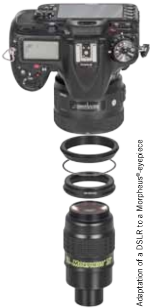
Adaptation of a DSLR to a Morpheus®-eyepiece