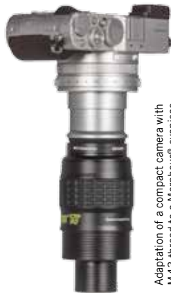
Adaptation of a compact camera with M43-thread to a Morpheus®-eyepiece