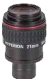
Hyperion® 68° / Hyperion® Aspheric eyepiece with fixed focal length, with M43 and SP54-threads