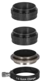
#2456322 Quick Changer 1.5mm extension #1508154 1.5mm extension #1508154 1.5mm extension