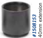
#1508153 40mm extension