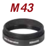
Hyperion® / Morpheus® M43 Extension # 2954250 to adapt lenses with M43-thread – protects the lenses from touching each other