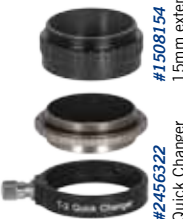
#2456322 Quick Changer 1.5mm extension #1508154 1.5mm extension