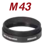
Hyperion® / Morpheus® M43 Extension # 2954250 to adapt lenses with M43-thread – protects the lenses from touching each other

One adjustment spacer ring made of hard plastic for the SP 54 thread is part of each Hyperion DT-ring free of charge. With these spacer rings (each ring has a thickness of only 1 mm), differences in mechanical heights may be adjusted, to be able to adapt the camera front lens as close as possible, without having to use the 11 mm extension ring (# 2958090).