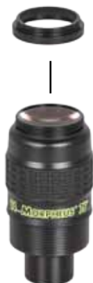
Hyperion® / Morpheus® T-Adapter M43/T-2 # 2958080