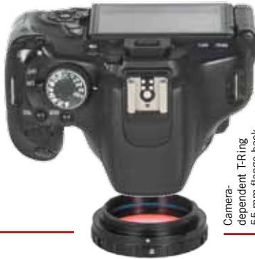
Camera-dependent T-Ring 55 mm flange-back