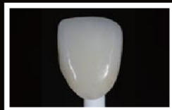
Full contour crown