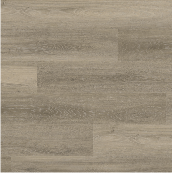
Bordeaux Plank PLF7006SH