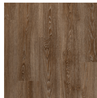
French Loft PLF4254G