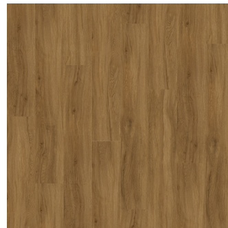
True Coir PLF4314