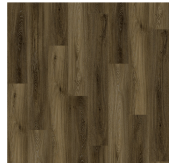
Abaca Root PLF4316