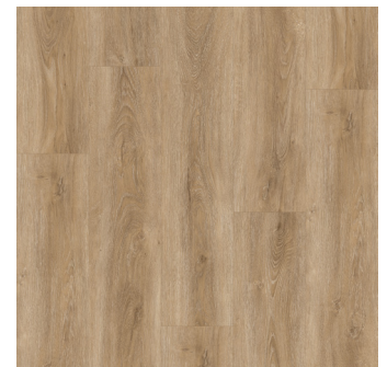
Brushed Cotton PLF4312