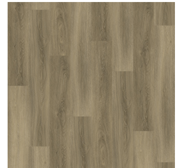
Woven Cashmere PLF4315