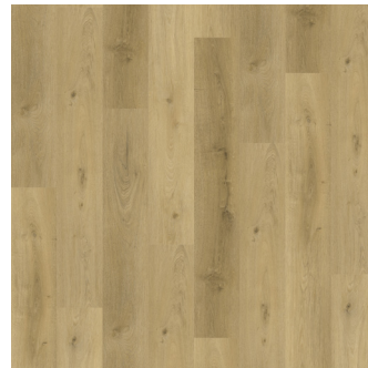
Cool Linen PLF4313