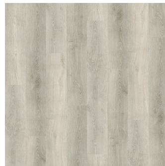
Angora Wool PLF4311