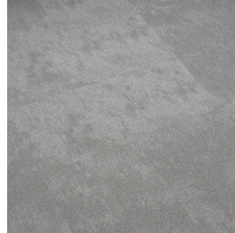
Cloudy Boulevard PLF300

© This technical data sheet was written by PlusFloor , Carnforth Business Park, Oakwood Way, Carnforth, Lancashire, LA5 9FD. At the time of writing and publication of this document, all information is specified correctly. The company reserves the right to change the specifications of this product at any time without prior notice to third parties.