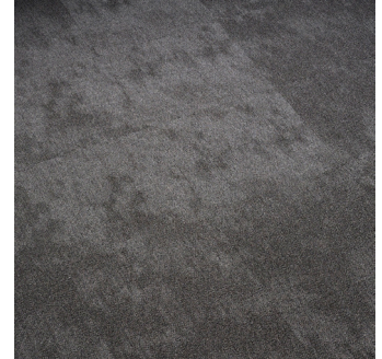
Broadway Shade PLF302