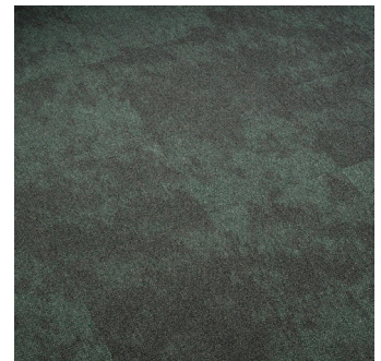
Urban Park PLF308