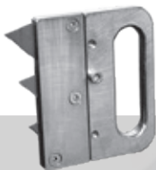
TRIPLE BLADE Up to 20 mm -Accessory- Ref. 45 18 97