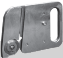
ALUM COMPOSITE Up to 4 mm -Included- Ref. 45 19 90