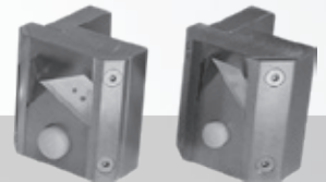
V-GROOVE SEMI-RIGIDS Up to 20 mm -Accessory- Ref. 45 19 85 / 45 19 86 + 45 19 04