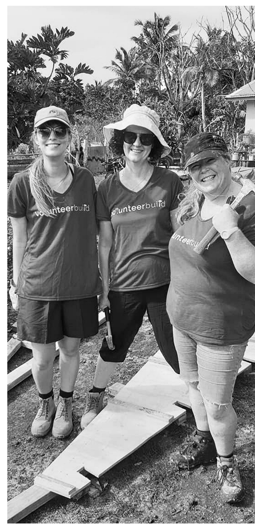
July 2019 - Partnering with Volunteer Build (NGO) to complete two homes on 'Eua following Cyclone Gita.