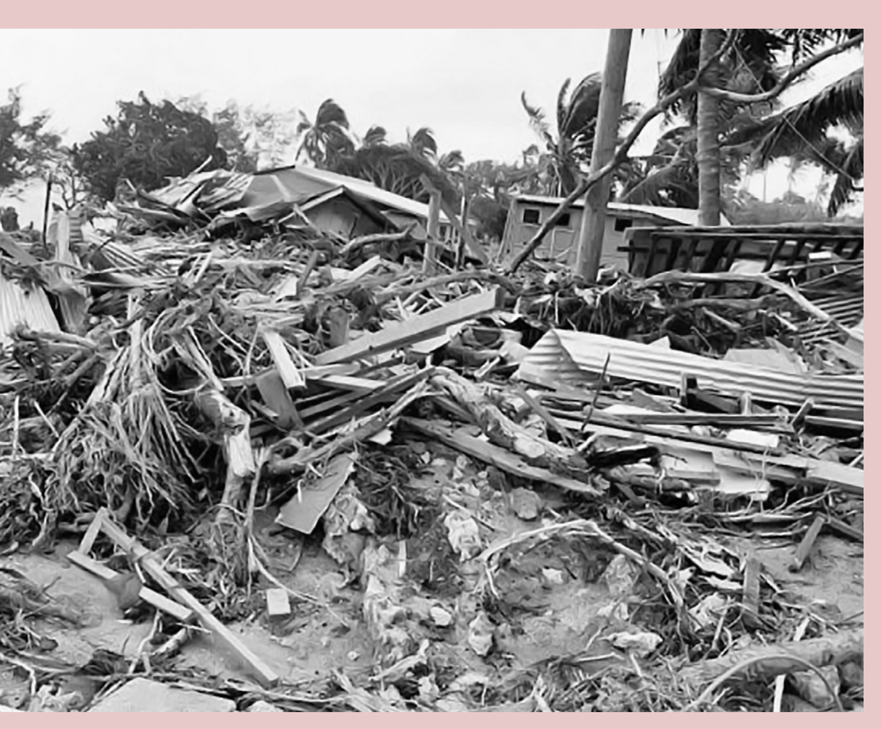
February 2018 — Path of destruction left behind Cyclone Gita in The Kingdom of Tonga.

2020 Impact Statement ______ Heilala Vanilla, New Zealand