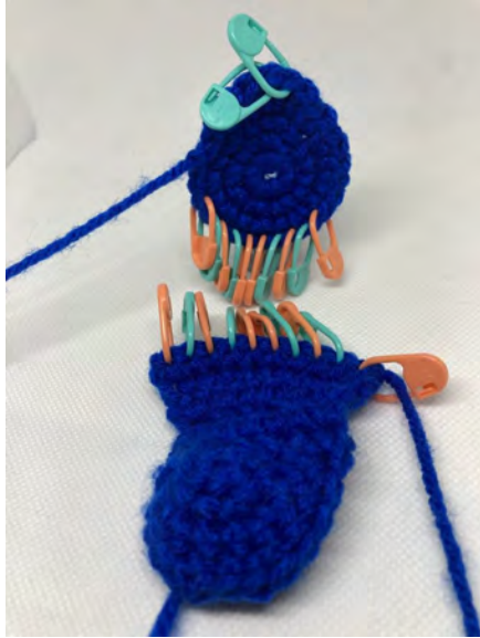
Individual marked stitches