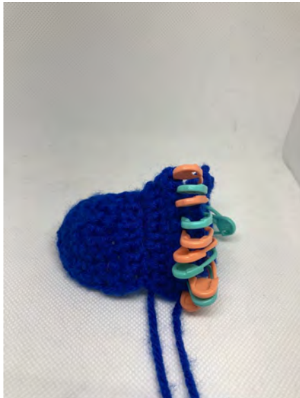
The other side