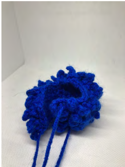
All filled up and ready to sew on. If you added the ears first, here is a first fitting