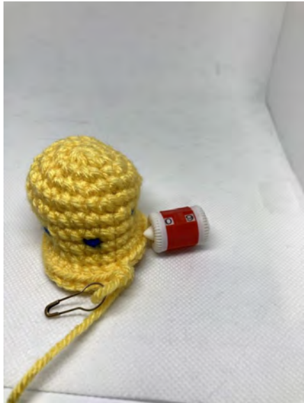
Row 10: 15 Sc, DecX3, 15 sc (31)