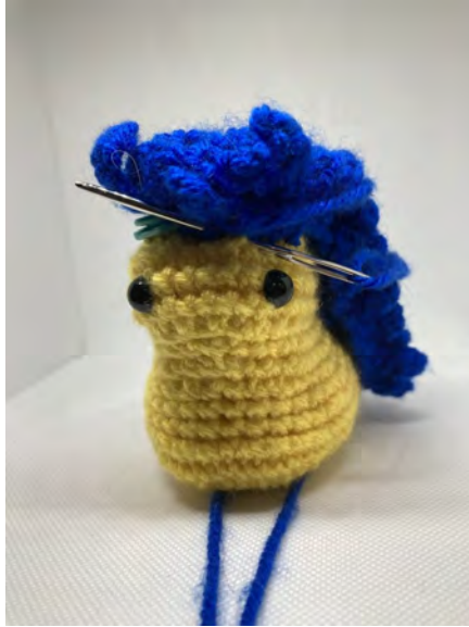
The patch is sewn onto the second row up

Starting with that front space you marked with a stitch marker as an anchor, sew the back patch flush to the slug.