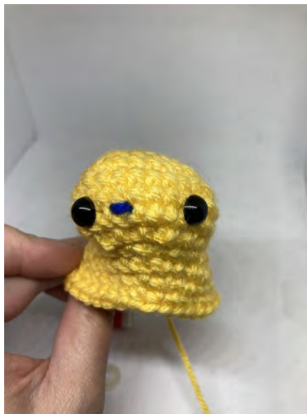
Six spaces apart