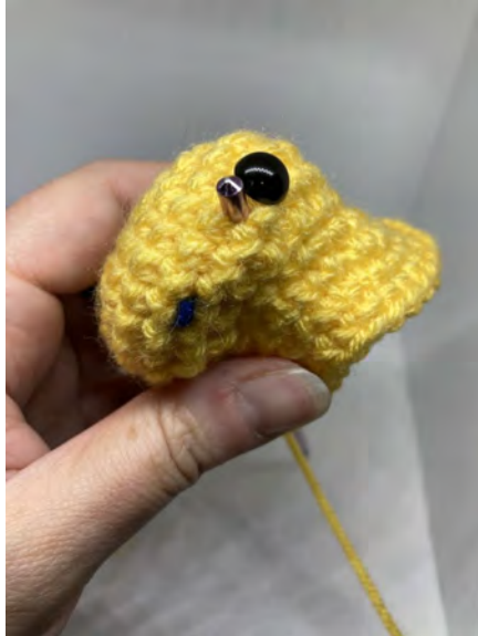
This is one space to the left of the eye