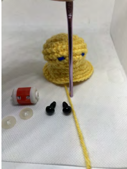
Find the center point ^^