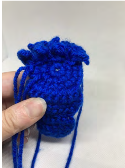
Back and forth, repeat steps 1-3 over and over