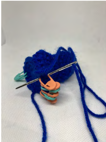
Stitching them together

Don't try to make the piece flat, it's supposed to look like a Z, so that it fits better on the slug.