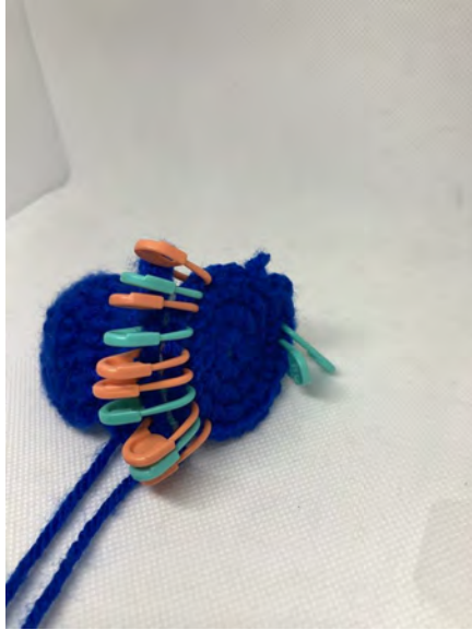
lined up and marked in pairs