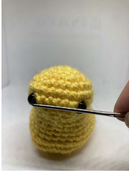
This is the row zero