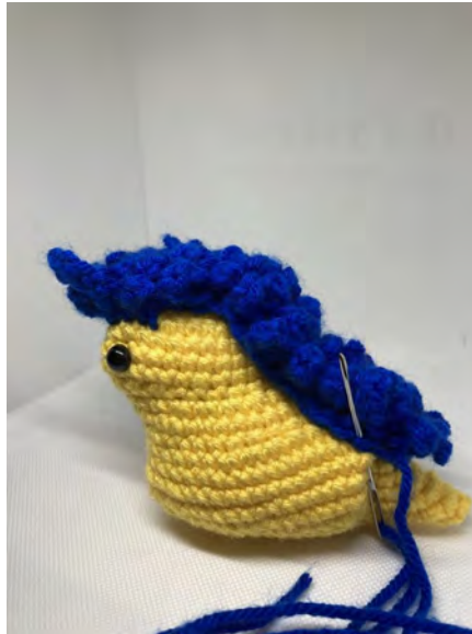
And around, following the contours

When you're done, the slug kind of looks like it's got a headband on that's too tight.