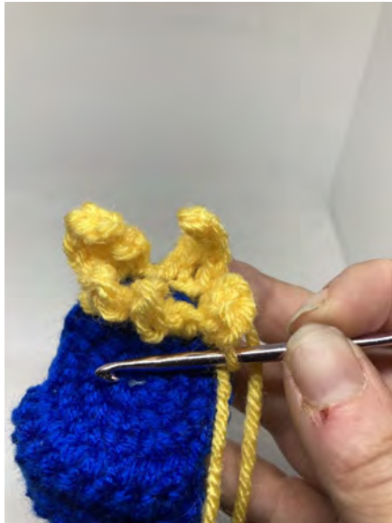
Two zig zag rows of nobbles

Repeat steps 1-3 in a zig zag pattern down the back patch. It's okay to skip a post. Only put a few nobbles per row, they fill up the space quickly. Don't worry if you have a bit of room around the edges, you'll fill in the space after you sew the back patch on.