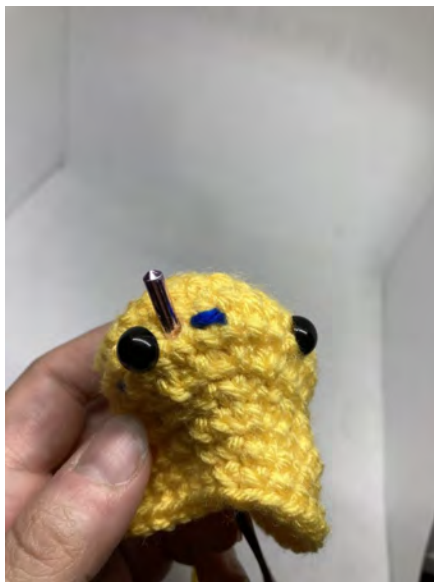
This is the sixth space ^^