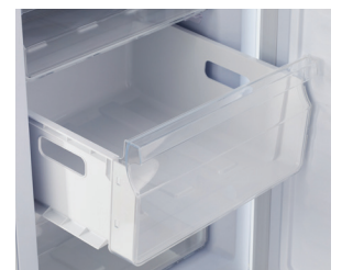
Multiple storage drawers for easy access