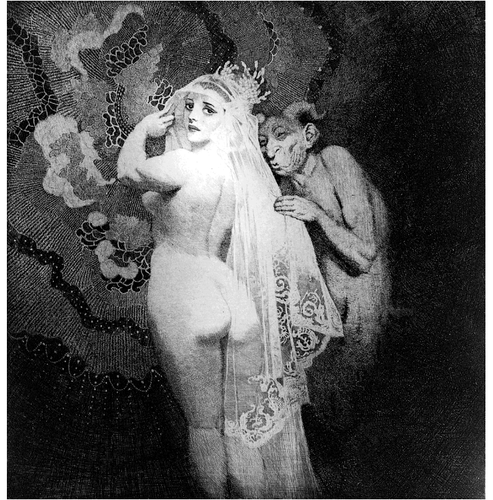
The Bride 22.8 x 21.5 cm