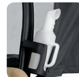
Divot Repair Sand Bottle