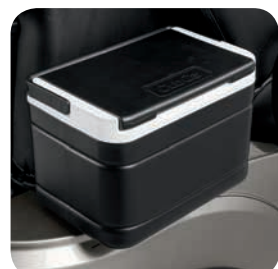
Caddy Master Cooler