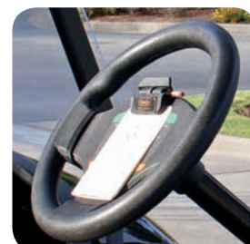
Comfort Grip Steering Wheel