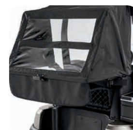
Bag Cover with Magnetic Latch