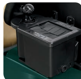
Ball and Club Cleaner