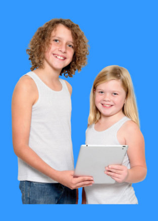
Shielding singlets for kids & women