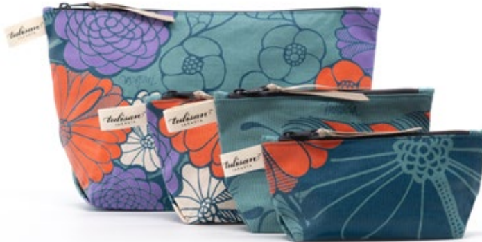
ORG2006-GG Green Grass