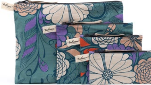
POU2006-GG Green Grass