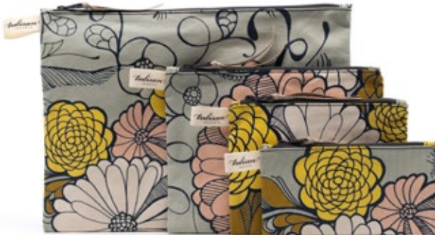
POU2006-LM Light Mint