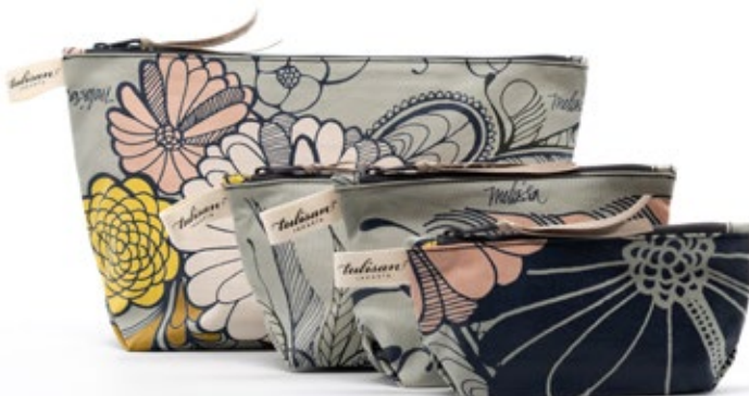
ORG2006-LM Light Mint