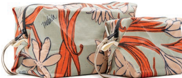
CUB2004-SR Smokey Rose