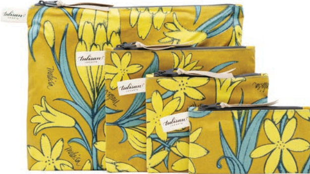
POU2004-YO Yellow Olive