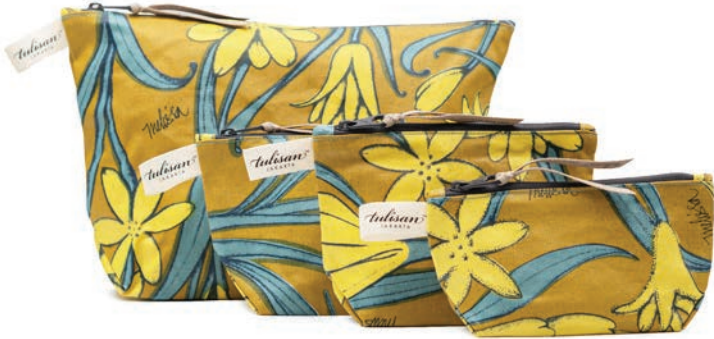
ORG2004-YO Yellow Olive