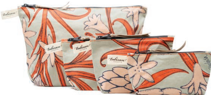
ORG2004-SR Smokey Rose