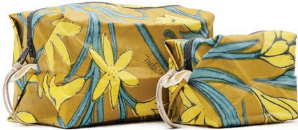
CUB2004-YO Yellow Olive