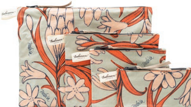
POU2004-SR Smokey Rose