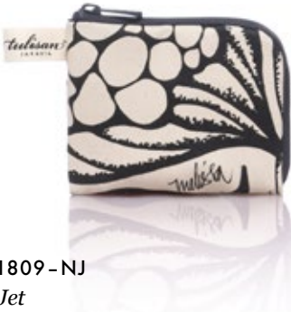
WVA1809-NJ Nero Jet