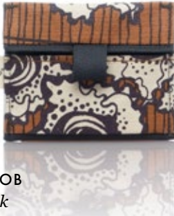
WAC1808-OB Orange Brick