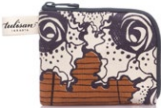
WVA1808-OB Orange Brick