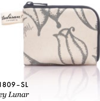
WVA1809-SL Smokey Lunar