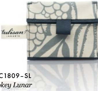
WAC1809-SL Smokey Lunar