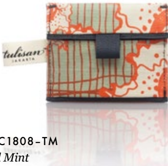
WAC1808-TM Teal Mint