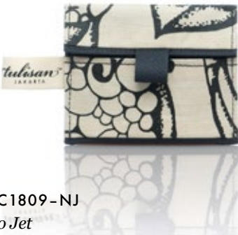
WAC1809-NJ Nero Jet