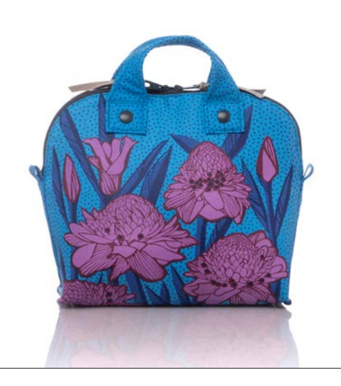
The Bien Strap is sold separately