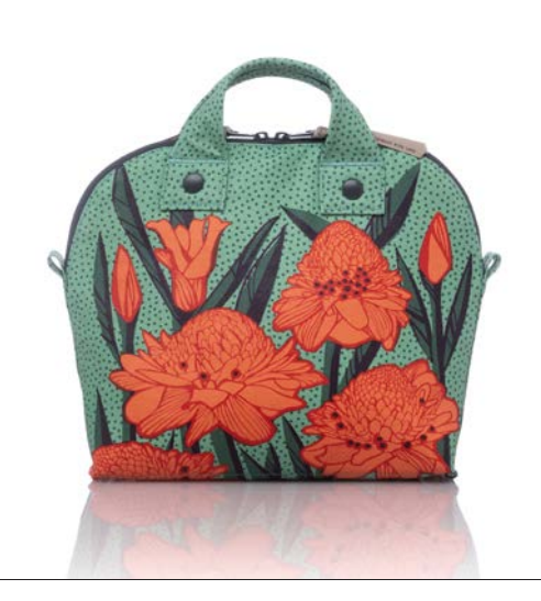
The Bien Strap is sold separately