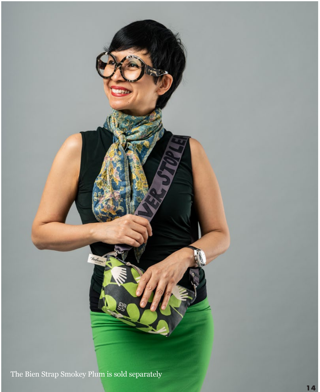
The Bien Strap Smokey Plum is sold separately