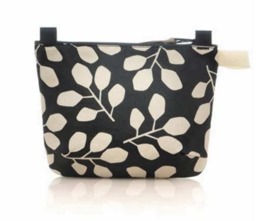
The Bien Strap is sold separately