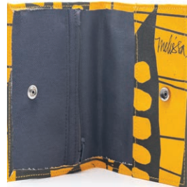
CJO2007-YS Yellow Sunflower