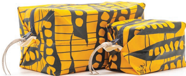
CUB2007-YS Yellow Sunflower