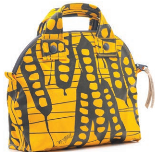
BMU2007-YS Yellow Sunflower