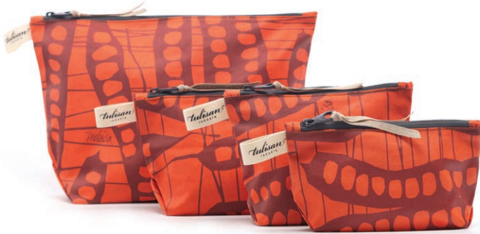
ORG2007-OS Orange Salmon