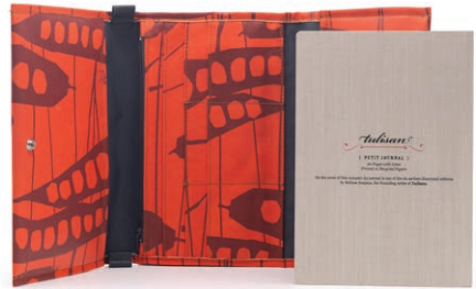
CPO2007-OS Orange Salmon