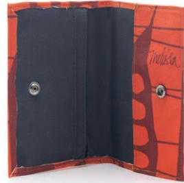
CJO2007-OS Orange Salmon