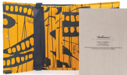
CPO2007-YS Yellow Sunflower