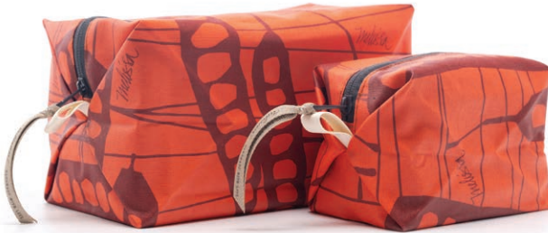
CUB2007-OS Orange Salmon