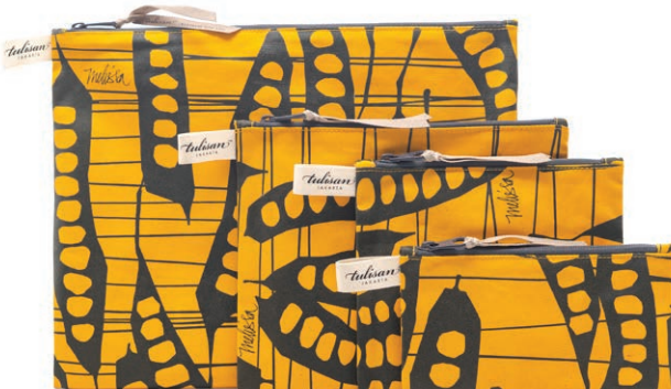
POU2007-YS Yellow Sunflower