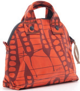
BMU2007-OS Orange Salmon