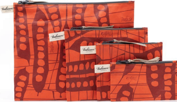
POU2007-OS Orange Salmon