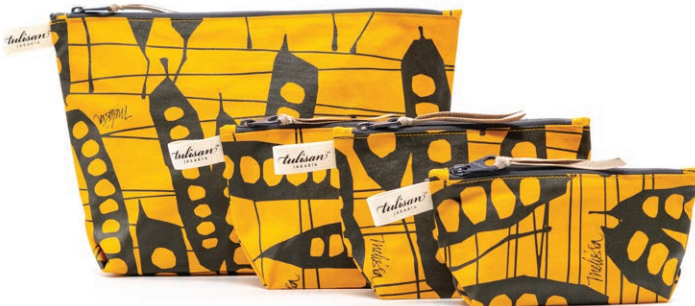
ORG2007-YS Yellow Sunflower