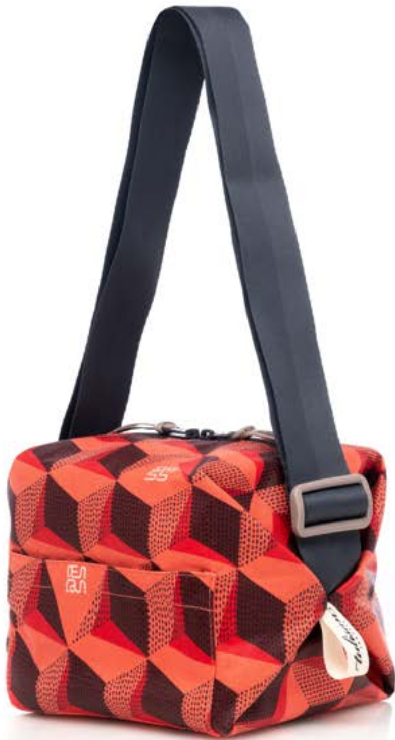
BDI2200-RB Red Blush