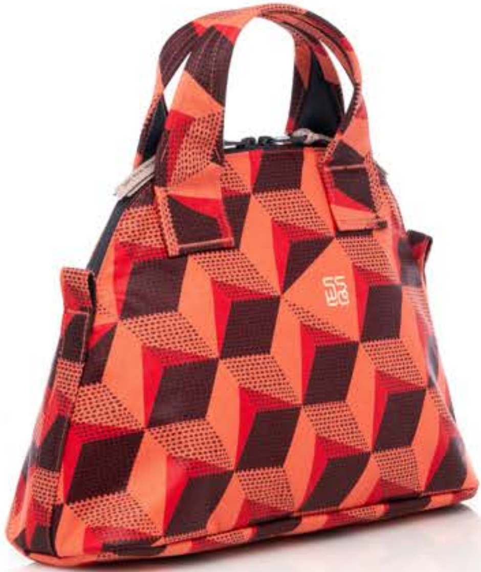
BRO2200-RB Red Blush