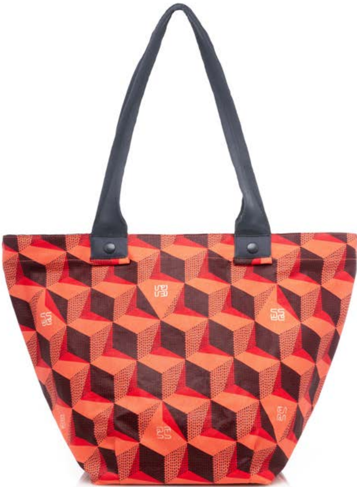
TCI2200-RB Red Blush