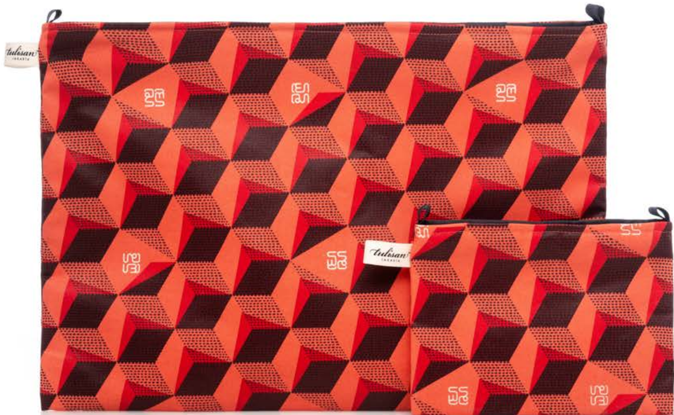
PKE2200-RB Red Blush