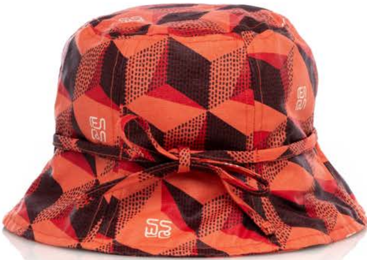
ATW2200-RB Red Blush