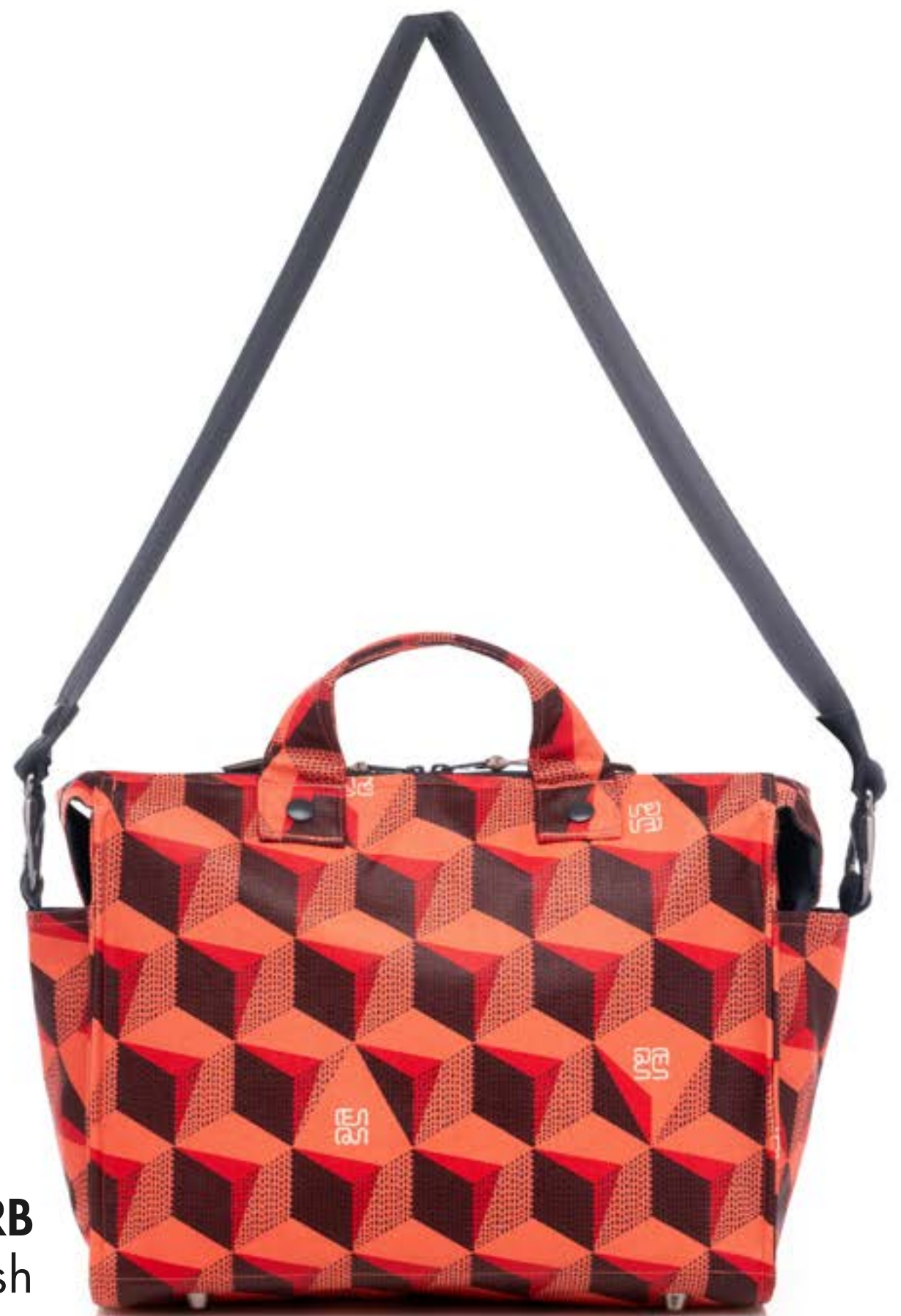
BOT2200-RB Red Blush