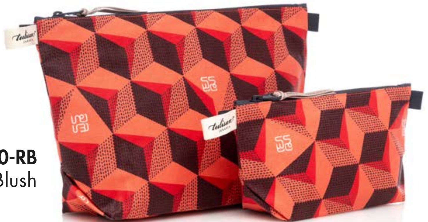
ORG2200-RB Red Blush