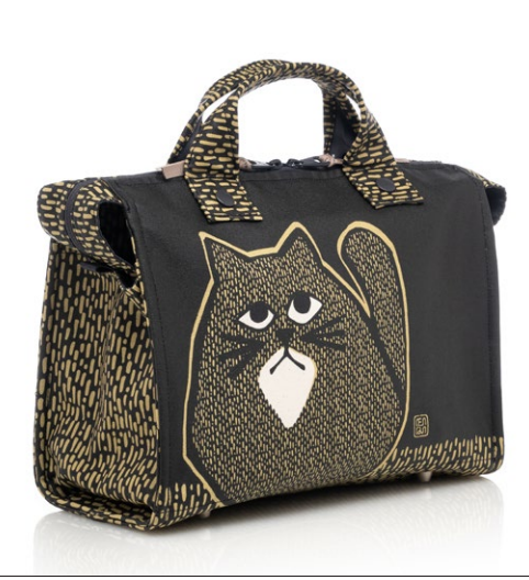
The Bien Strap is sold separately