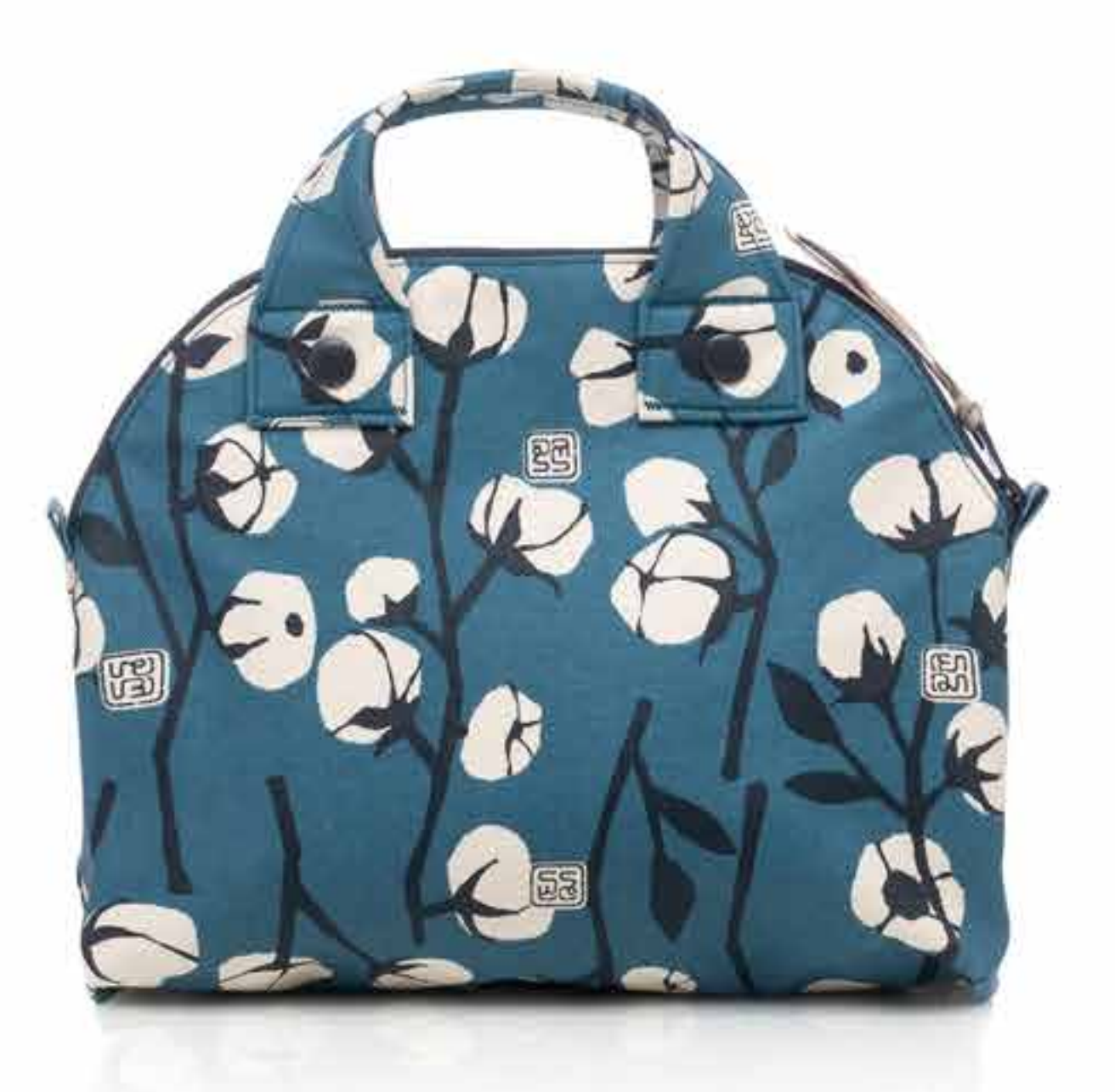
BMU2271-TA Turquoise Algae