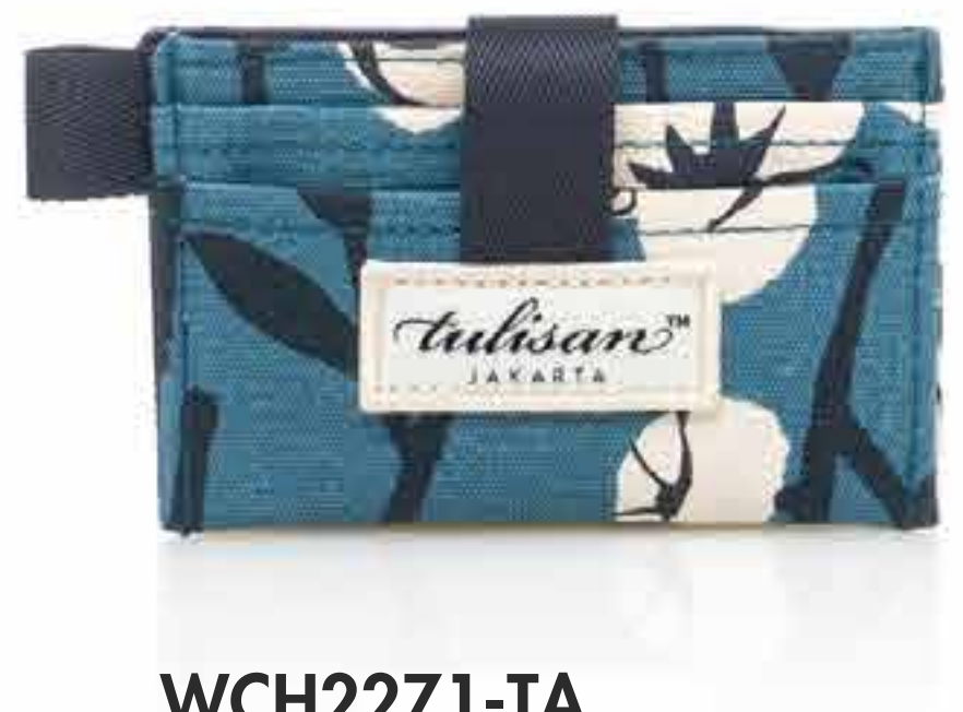
WCH2271-TA Turquoise Algae