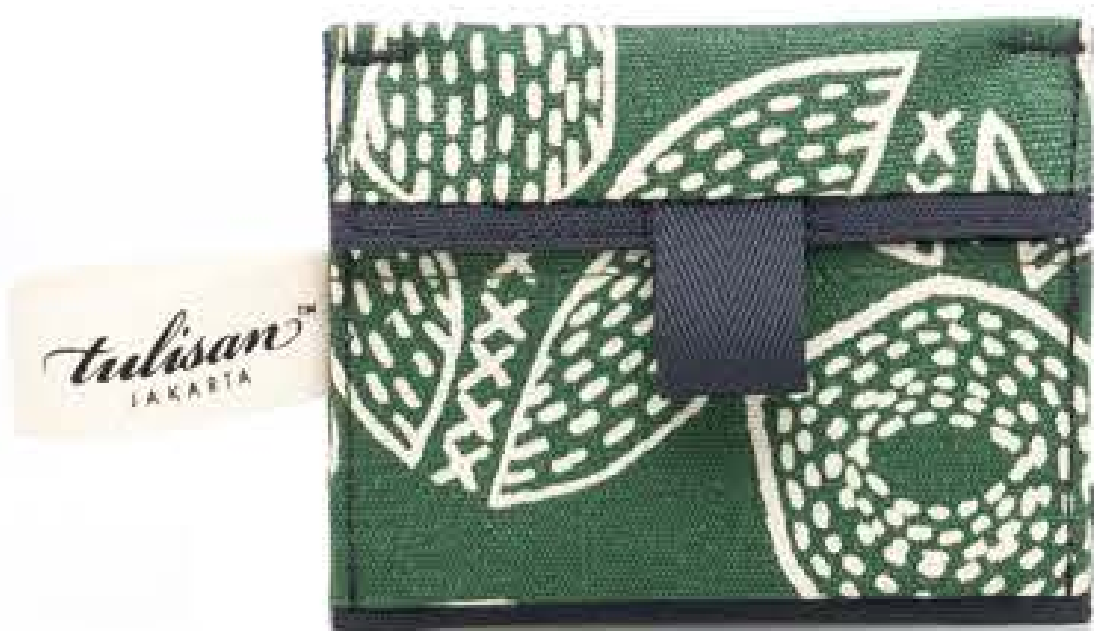
WAC2274-GG Green Grass