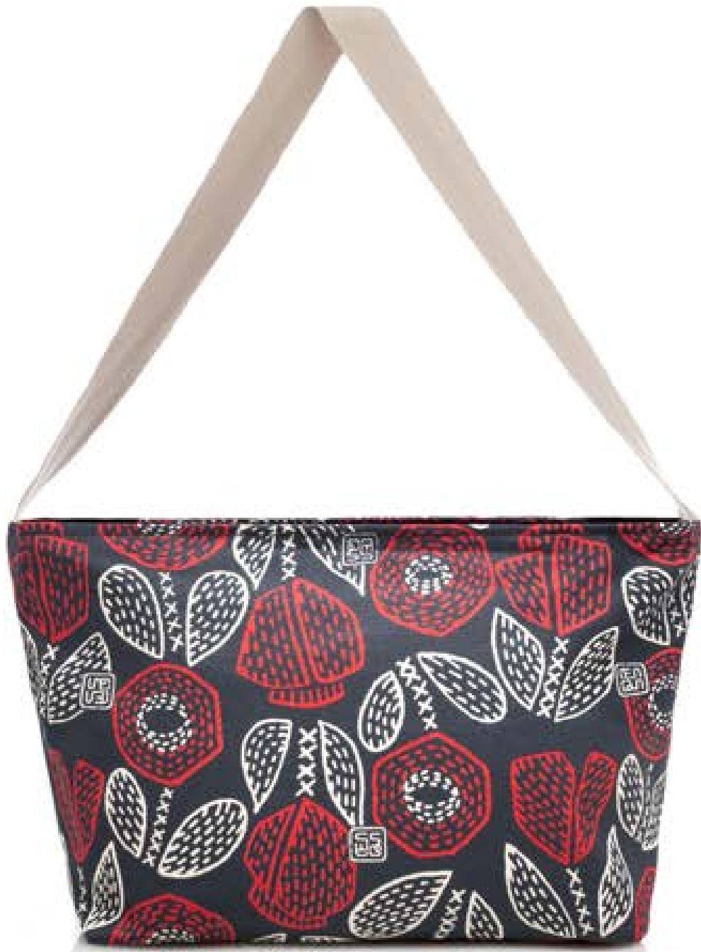
TPI2275-NI Nero Indigo