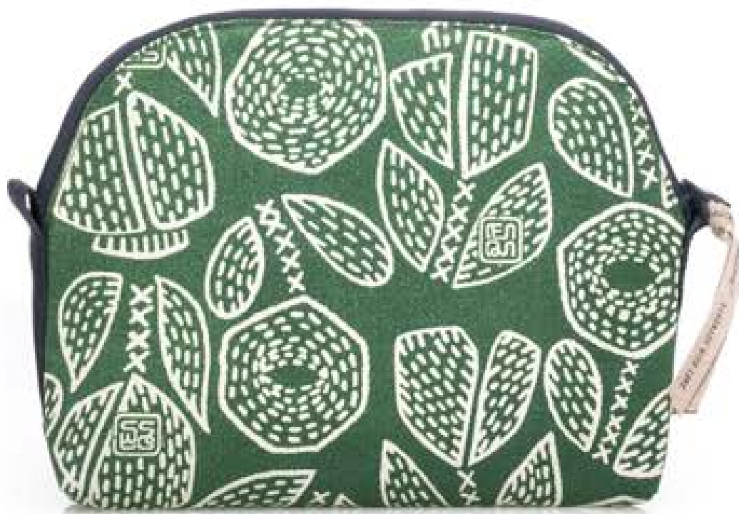
PSO2274-GG Green Grass