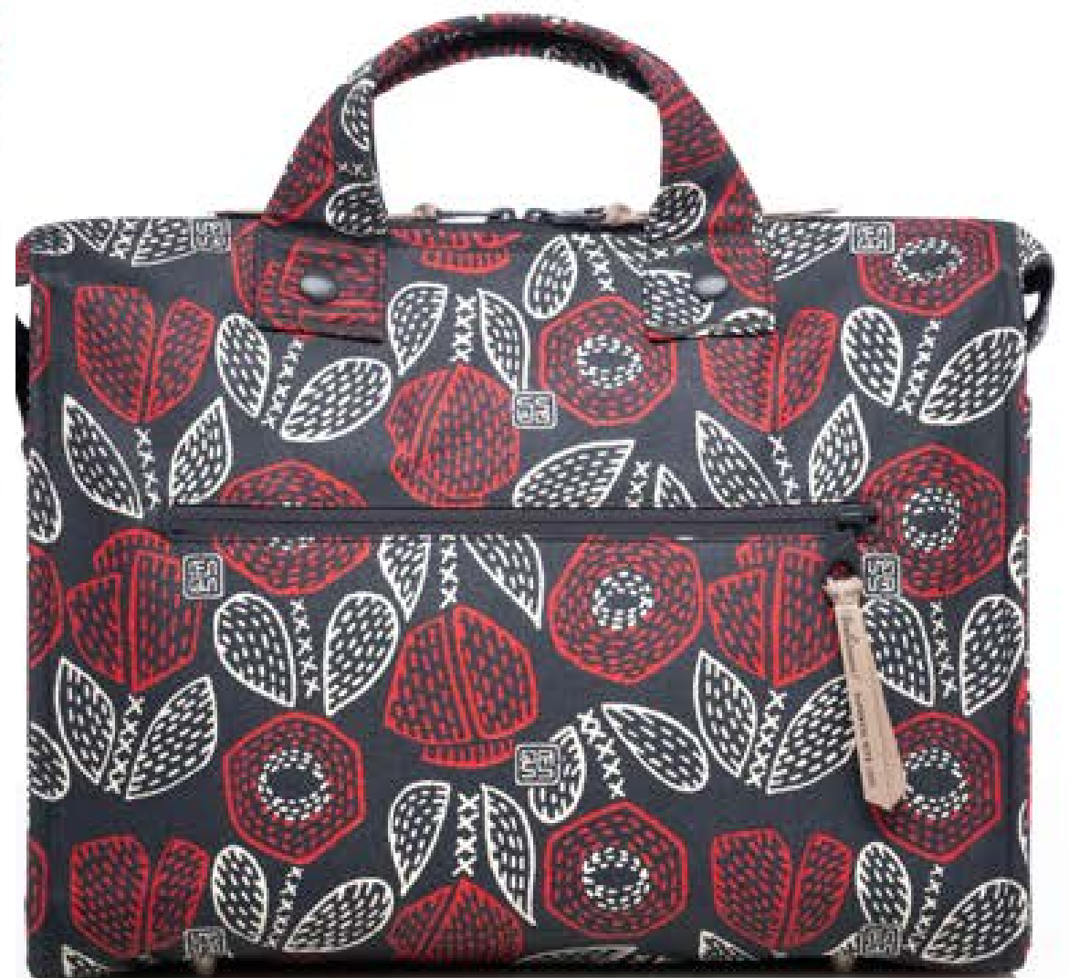
BOT2275-NI Nero Indigo