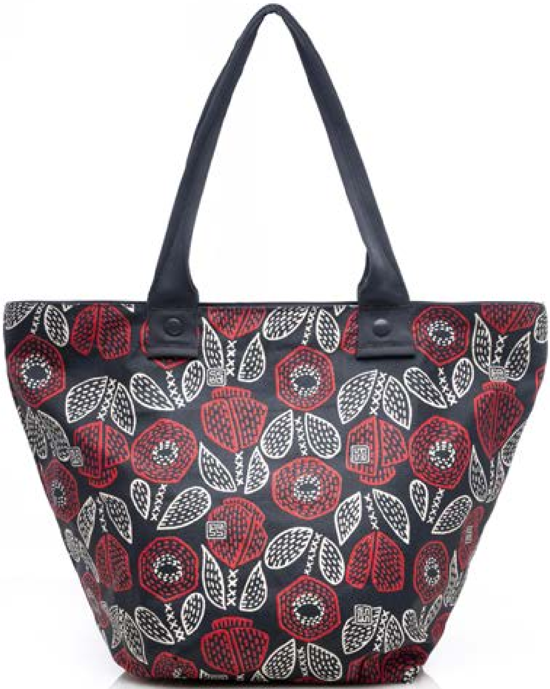
TCI2275-NI Nero Indigo