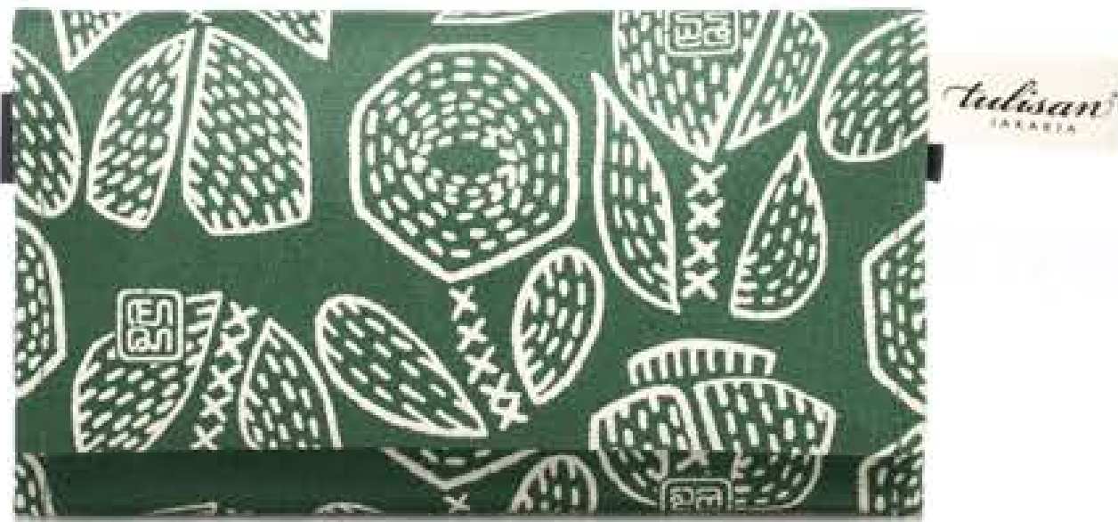
COL2274-GG Green Grass