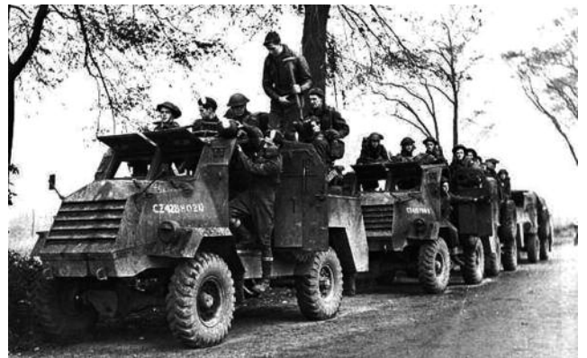
Forces of the Royal Hamilton Light Infantry, part of the 2nd Canadian Infantry Division...in C15TA trucks during the Battle of the Scheldt, October 1944.