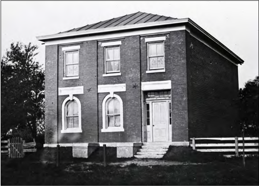
Former Nauvoo Masonic Hall, 1885.

lay stripped of the emblems and insignia of its holy and Masonically inspired purpose. Eight months later, the senior apostle would pass on, leaving President Lorenzo Snow as the last surviving Nauvoo Mason. 11 By the time the Nauvoo Masonic Hall was restored in the latter part of the twentieth century, even its original purpose would be masked with a new name, the “Cultural Hall.” 12