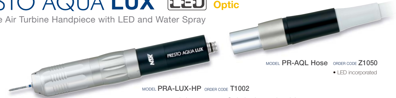
MODEL PR-AQL Hose ORDER CODE Z1050 • LED incorporated

Lube Free Air Turbine Handpiece with LED and Water Spray