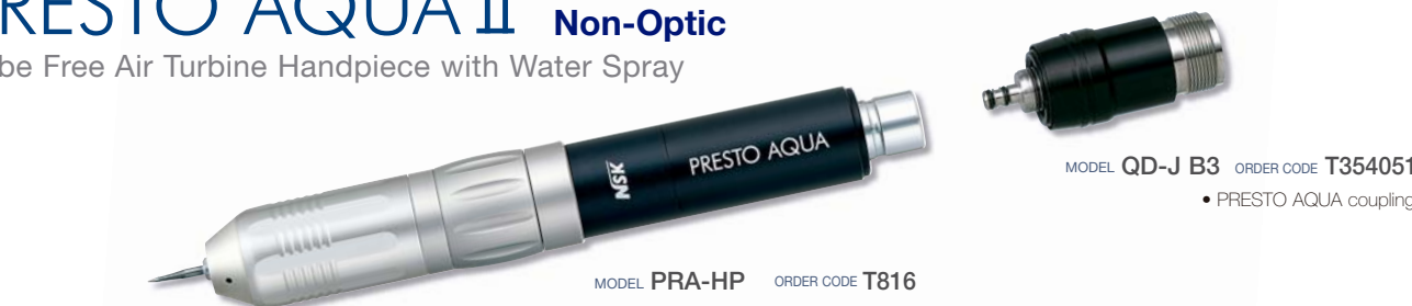
MODEL QD-J B3 ORDER CODE T354051 • PRESTO AQUA coupling

Lube Free Air Turbine Handpiece with Water Spray