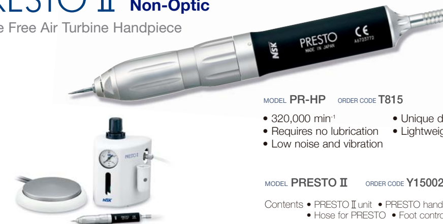
MODEL PR-HP ORDER CODE T815