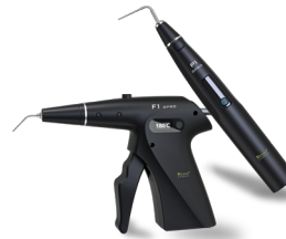
Gutta-percha Obturation System