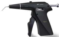
Gutta-percha Obturation Filling Machine