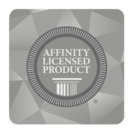
Affinity Licensed Product hologram decal