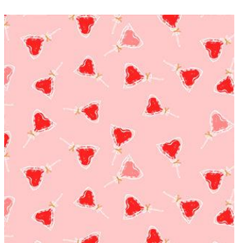
SWEET ON YOU: Coral Chocolate Berries