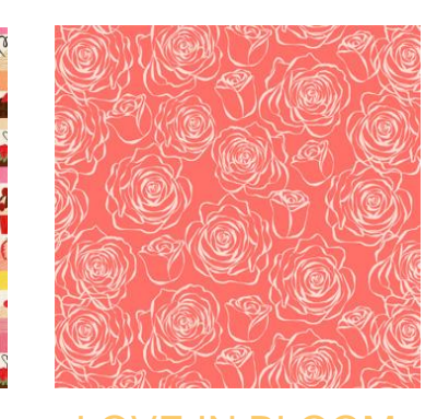
LOVE IN BLOOM: Roses Wine