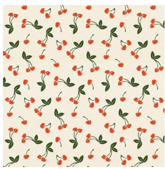
SWEET ON YOU: Cream Cherry Hearts